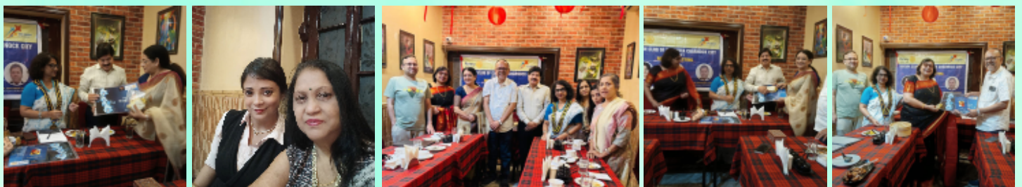
524th RM at Kilmi on 30 th April 2025 with BOGS PRESIDENT ELECT AND SECRETARY ELECT