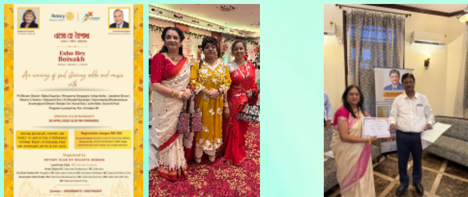
Participating in District program