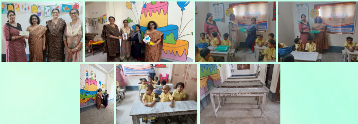
Donation of 4 school benches to Swapna Choya School at Joka. An Easy School project