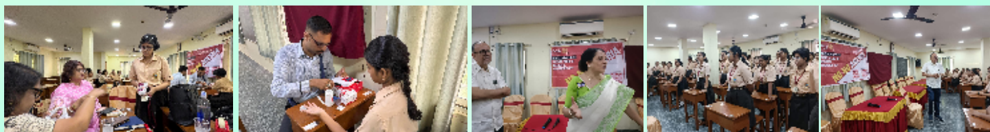
NO NO ANEMIA - Monthly Project at Mansur Habibullah Memorial School on 29th April